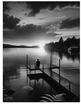
LEGAL NOTICES CONTINUED ON NEXT PAGE