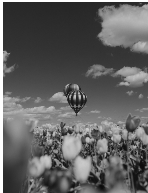
LEGAL NOTICES CONTINUED ON NEXT PAGE